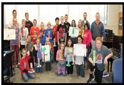
(The sixth graders work with FBLA members on business techniques)