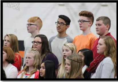
(Tiger junior high students sing at the Christmas concert.)