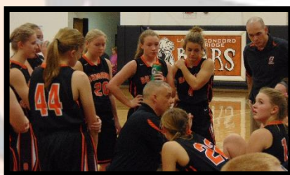
(The Tigers huddle during a timeout against Randolph.)

Ultimately the game came down to the Cardinals' solid free-throw shooting (21-for-30, 70%) and early missed shots by the Tigers.