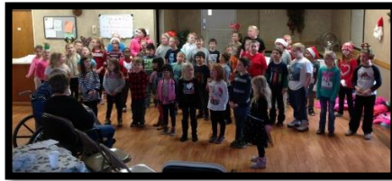
(Elementary students sing to residents at OGH)

The students were treated with cookies before returning to school.